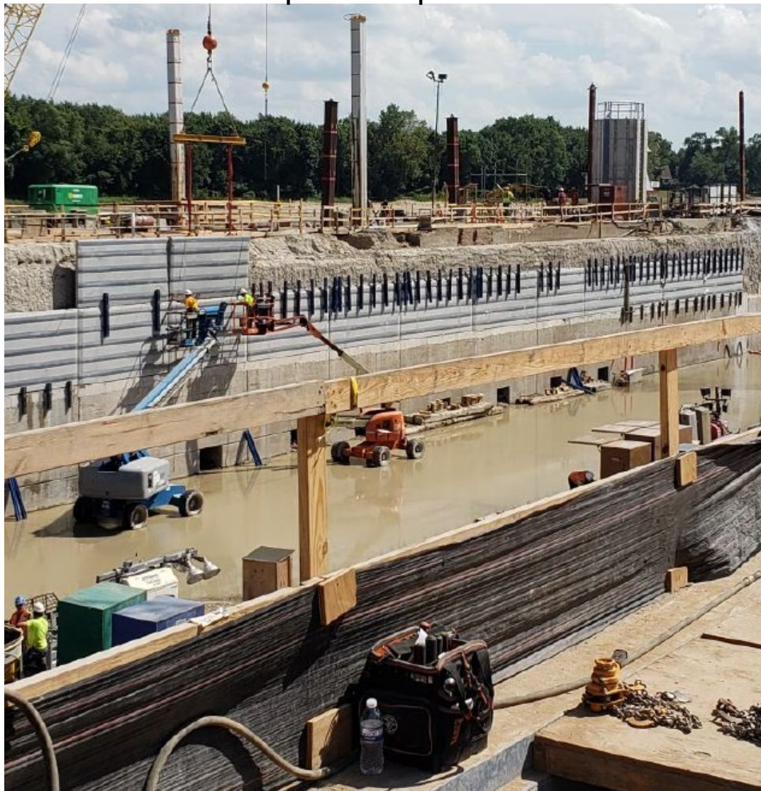
Vertical concrete pre-cast panel installation